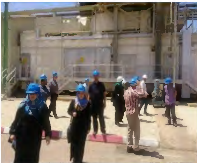
Study tour to Electricity Generation Company by NECC-TVET staff