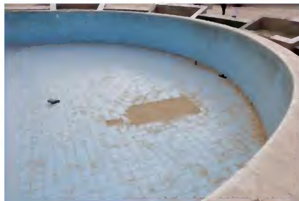
Central Fountain at Brotherhood Park before maintenance