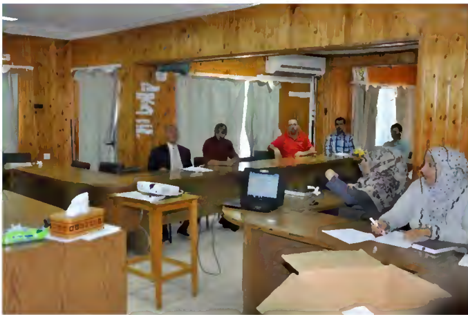
TVET staff attending Safety Measures training course