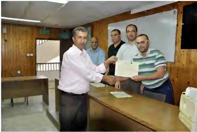
AutoCAD training course certificates distribution ceremony