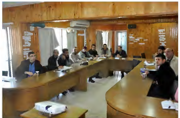
TVET staff attending “Educational Concepts” training