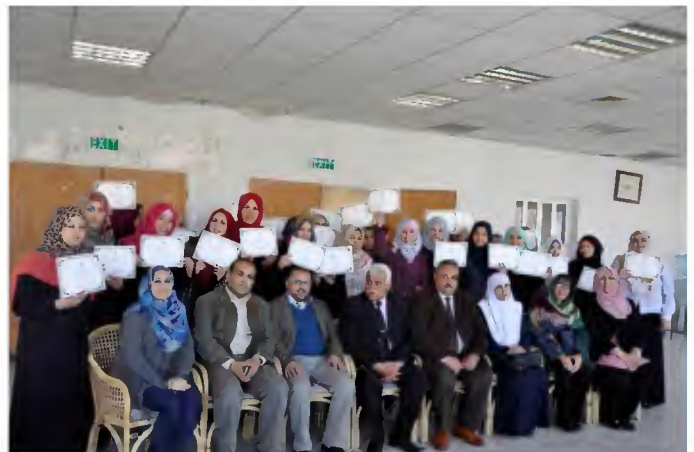
“First Aid” course certification ceremony