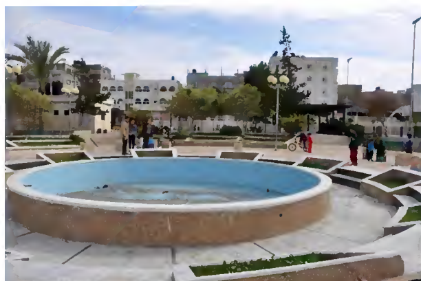
Central water pool was maintained

The project implementation went through a process passing from signing a contract with the municipality, tender advertisement, visiting the park site and tender settlement and selection of an implementing contractor.