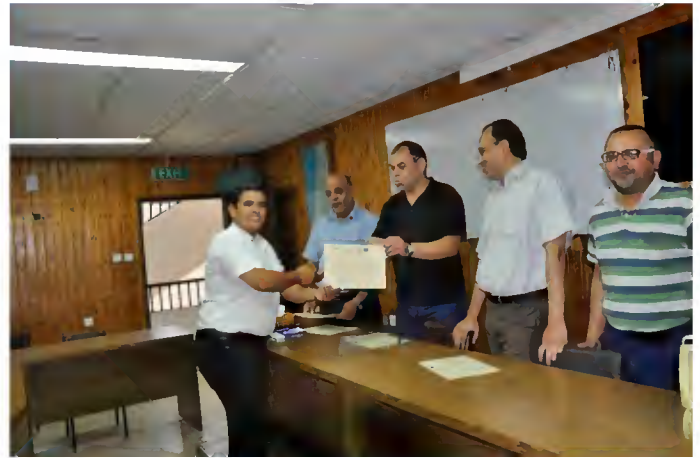
AutoCAD training course certificates distribution ceremony