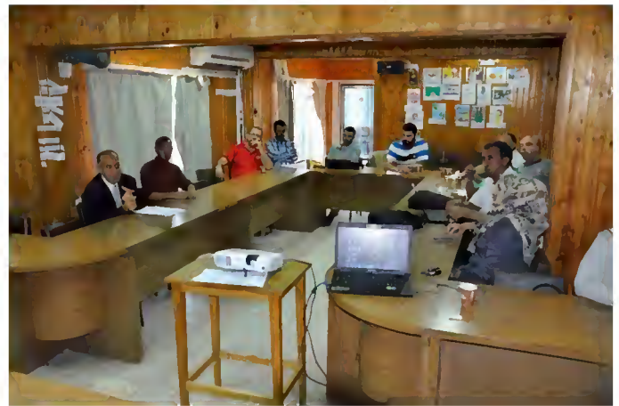
Safety Measures training course

The course included conducting field visits to our VTCs in addition to the Gaza electricity generation company to assess safety status at NECC-VTCs using designated checklists as well as visiting Gaza General Electricity Generation Station as a scientific study tour.