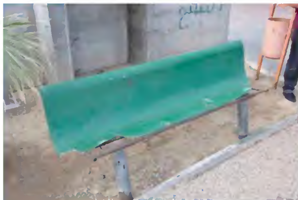
Benches at Brotherhood Park before maintenance