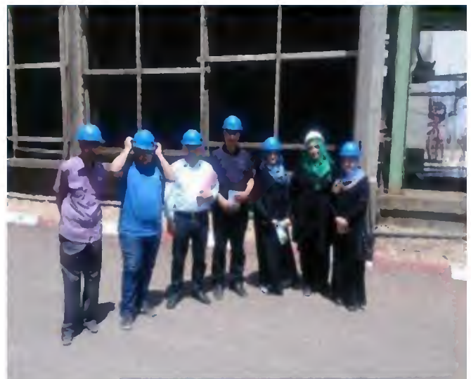
Study tour to Electricity Generation Company by NECC-TVET staff