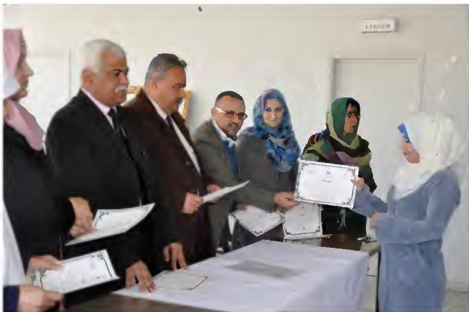
“First Aid” course certification ceremony

In cooperation with the Ambulance and Emergency Unit of MoH, two “First Aid” training courses were conducted targeting VTC female students (two professions of dressmaking and secretary) in separate.