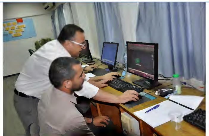
TVET staff receiving the AutoCAD course