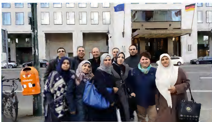
El-Qarara Supervisor (back left) Training in Germany

The supervisor was accompanied by GIZ-TVET Program Technical Advisor as well as representatives from 4 TVET providing institutes in Gaza Strip.