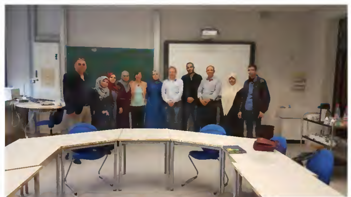
El-Qarara Supervisor (on the right) Training in Germany