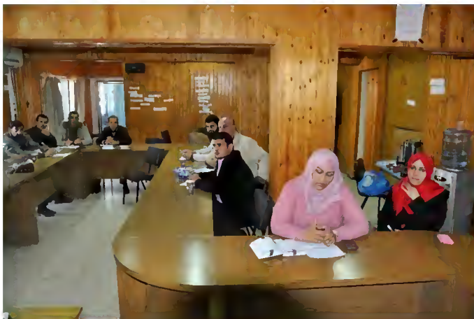
TVET staff attending “Educational Concepts” training