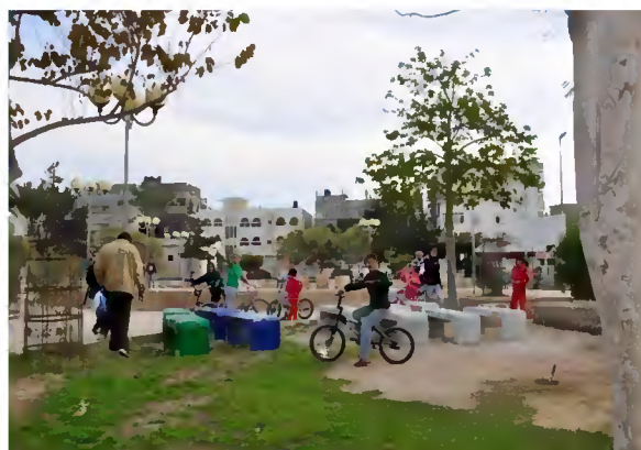
New concrete chairs were brought